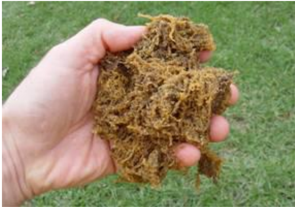
Fig. 3. Handful of plumatellid bryozoans ( Plumatella vaihiriae ) from the wall of a secondary clarifier of a municipal wastewater treatment (T.S.Wood, 2005).