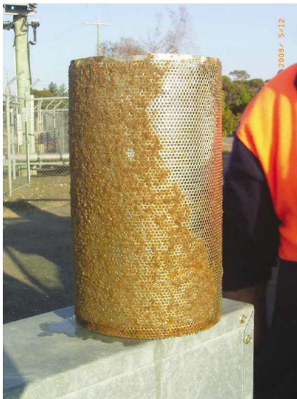
A metal strainer from the Ouyen pumping station, showing biofouling.

There are historical worldwide reports going back to the 1700's ; more up to date reports from the early 1900's to the present day are widely published. A recent university study in 2011-12 identified 5 bryozoan species in the Northern Mallee Pipeline.