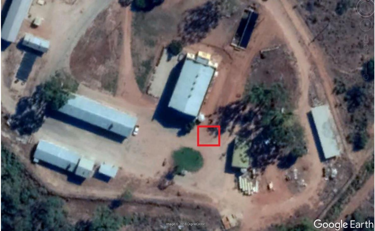
Figure 1: Location of wash-down area

The wash-down procedure for spray operators is to rinse the spray tanks and to empty the rinsate onto a designated gravelled area to control weeds. Figure 1 presents the location of the rinsate disposal area. This procedure ensures that rinsate is not discharged to any waterways and optimises the value of chemicals used.