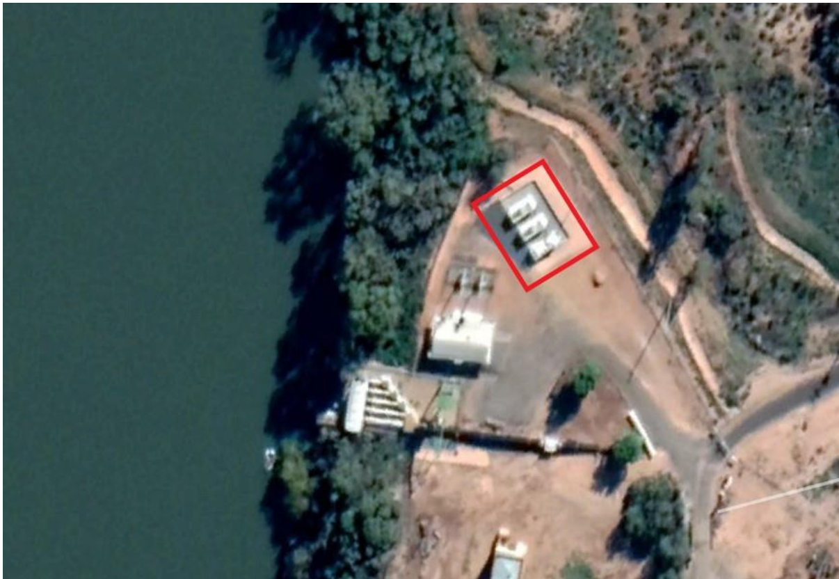
Figure 2: Location of Generators and Diesel Fuel Tank

Diesel tanks are to remain empty until earthen bund is reconstructed.