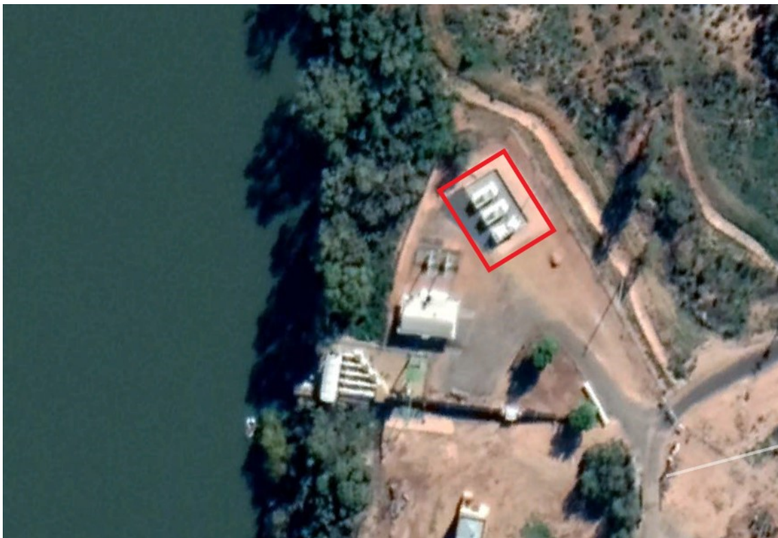
Figure 2: Location of Generators and Diesel Fuel Tank

Diesel tanks are to remain empty until earthen bund is reconstructed.