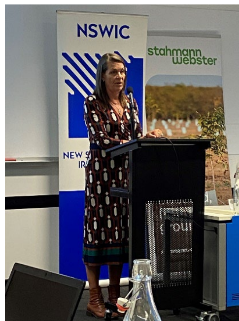
Will NSW Senator & Shadow Water Minister Perin Davey be the next federal Water Minister? Senator Davey was a guest speaker at the March 2025 NSW Irrigators Council meeting

We are unsure if the current Australian Government caretaker role will affect any of these timelines.