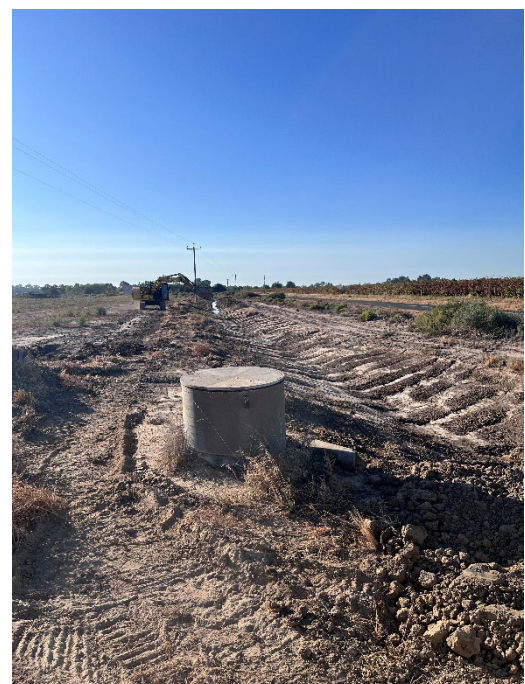
Surface drain maintenance in Curlwaa