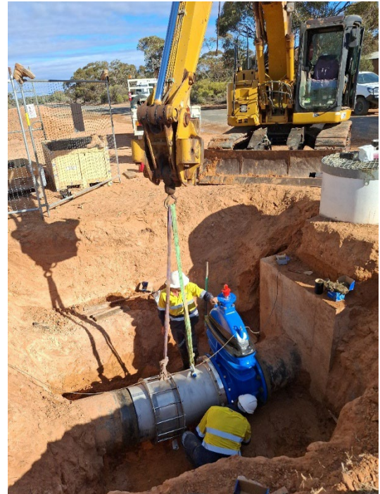
Replacing the isolation valve between Coomealla's rising main and the balance tower

Delivery Allowance is balanced on the last day of each quarter (30 September, 31 December, 31 March, 30 June), therefore trades must be successfully completed prior to the above dates.